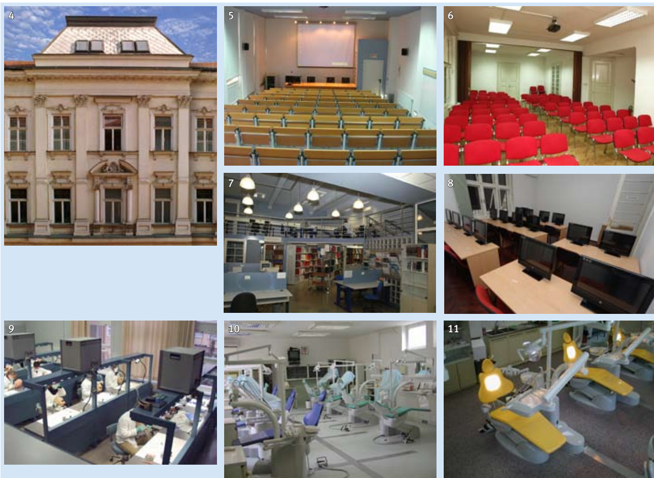
Slika 4. Pročelje Stomatološkog fakulteta u Zagrebu