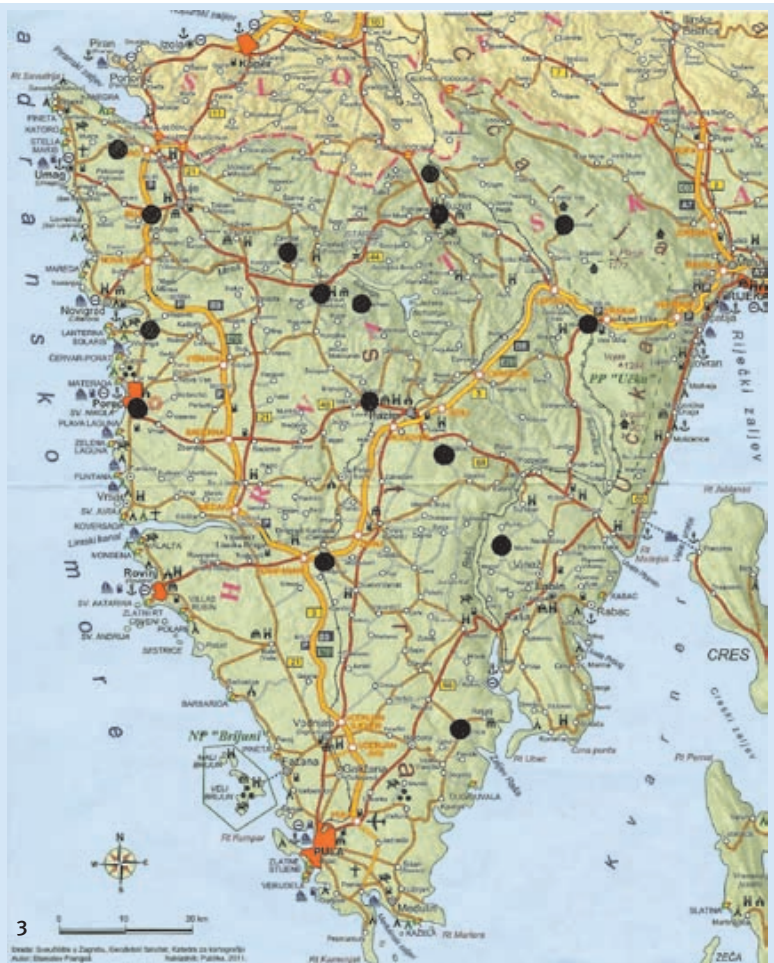
Slika 1. Detalj s fresaka iz svetišta Blažene Djevice Marije na Škriljinah u Bermu prikazuje svetu Apoloniju - drži zub u kliještima, svetog Leonarda s uzničkim lancima i svetu Barbaru - drži kulu s trima prozorima